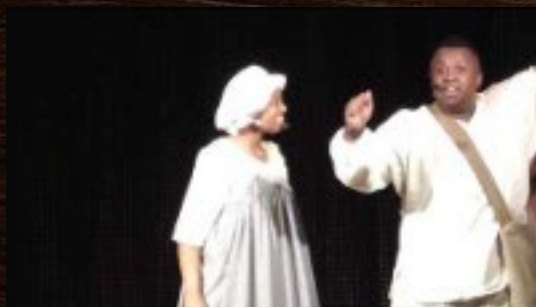
LANTERN OF MAGIC