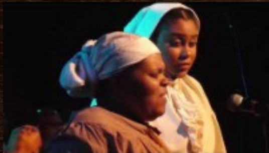
HER SOUL WAS TIRED

VIDEO CLIPS ARE FROM THE 2019 CONCERT PERFORMANCE