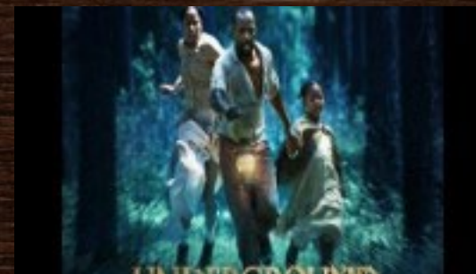
UNDERGROUND SHORT FILM